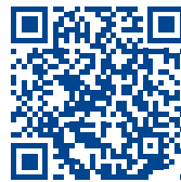
Eynesbury Entry Requirements

For the most current and comprehensive information on academic and English language admission requirements, please visit our webpages. We recommend checking these pages before applying to ensure you meet the most up-to-date admission criteria.