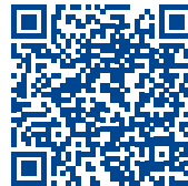
SAIBT Entry Requirements