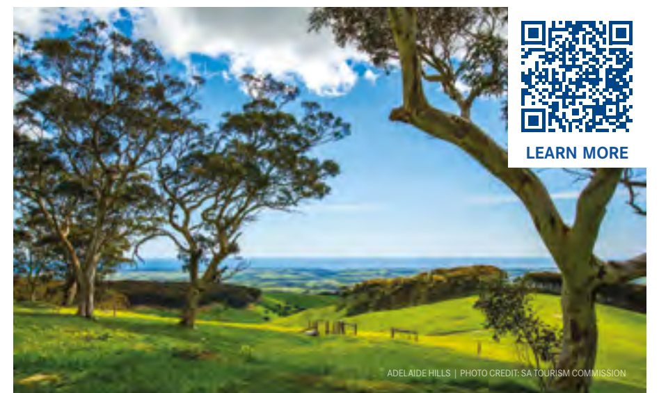
ADELAIDE HILLS

RANKED 9TH, 2025 ECONOMIST INTELLIGENCE UNIT'S GLOBAL LIVEABILITY INDEX