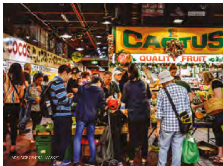
ADELAIDE CENTRAL MARKET